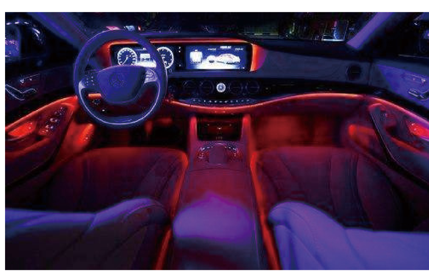
Car atmosphere lighting