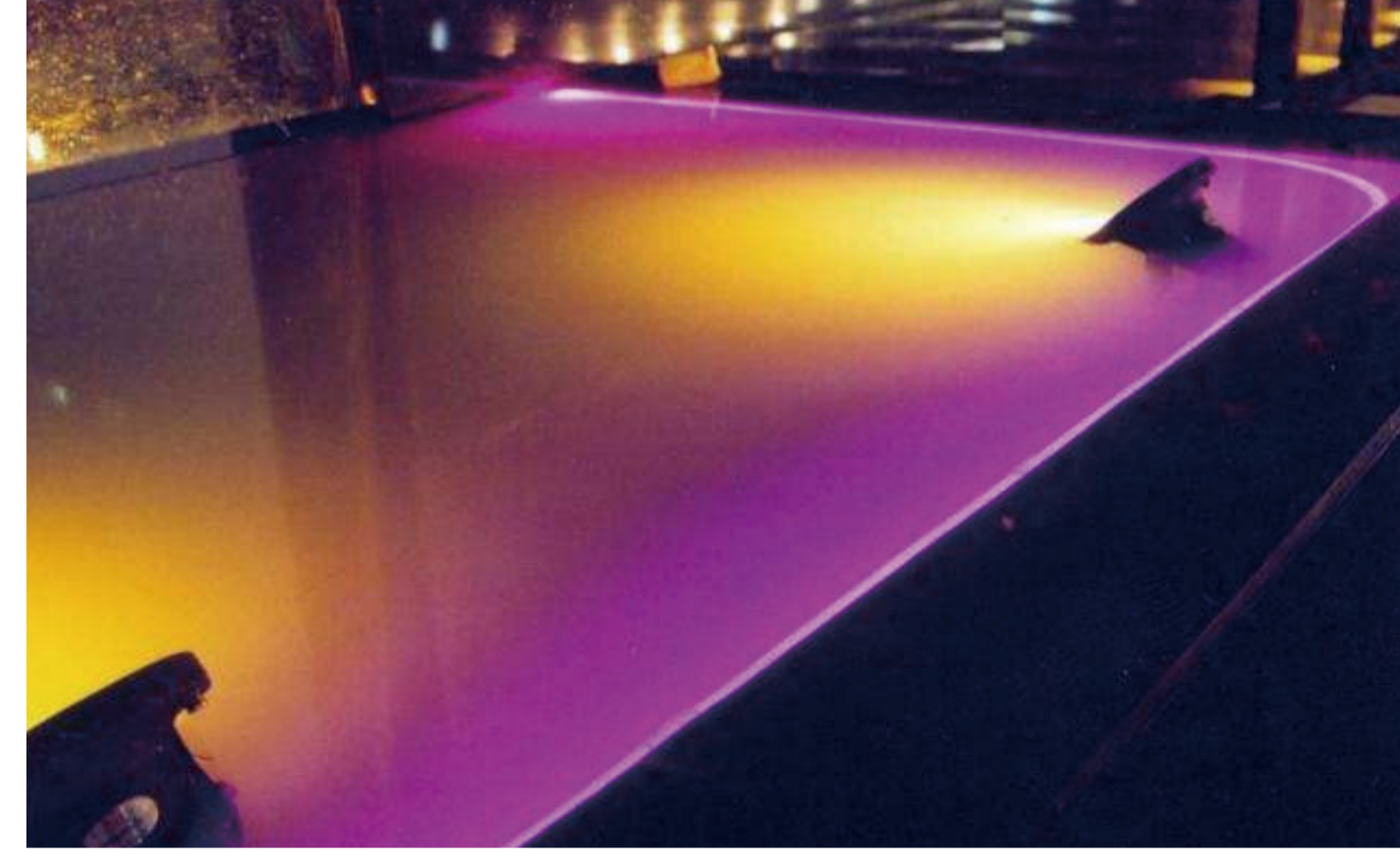
Underwater mood lighting