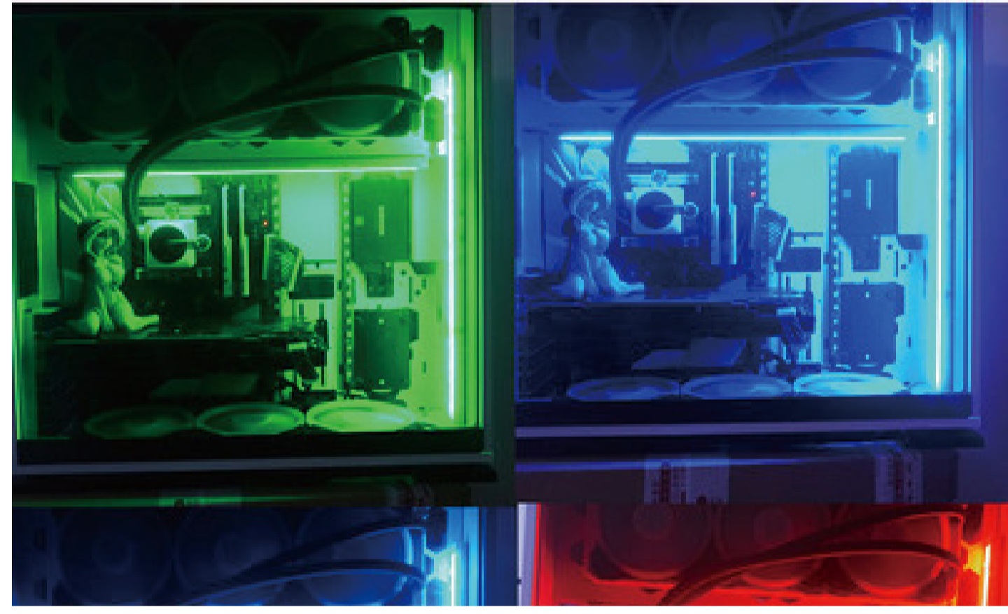
Product atmosphere lighting